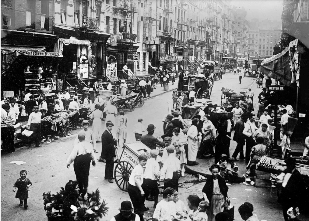
A Traffic Problem—Jay Walking

Do Not Help To Build a Chinese Wall Around Cincinnati Let's Make It Unanimous and—